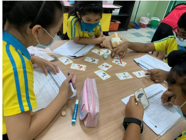
Questioning and discussing similarities and differences about animals

Throughout the discussion, students noticed that animals in the same group share common characteristics but also have some differences. For example, when observing the characteristics of a penguins and a chicken, a student remarked, “Both animals have wings. But while penguins are unable to fly, chickens can do so.”