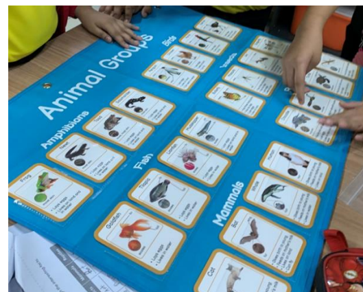
Grouping animals using animal classification cards