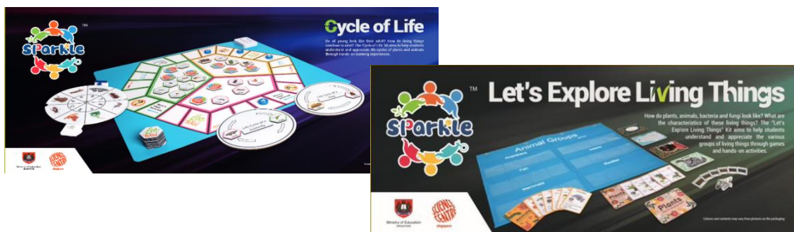
Examples of SPARKLE to support students' learning of Diversity and Cycle of Living things

Developed by the Ministry of Education (MOE) and Science Centre Singapore, the kits encourage students to explore and test their science ideas through lots of “hands-on, minds-on” activities accompanied with questions and discussion.